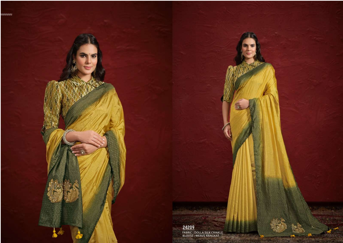
24209 FABRIC : DOLLA SILK CRINKLE BLOUSE : WEAVE RANGKAT