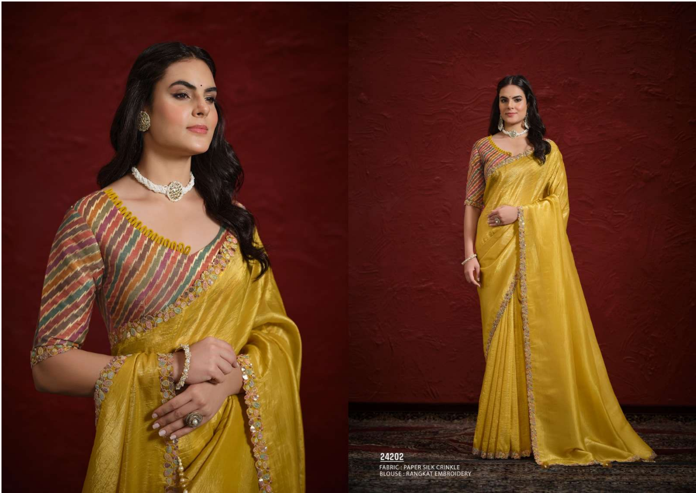
24202 FABRIC : PAPER SILK CRINKLE BLOUSE : RANGKAT EMBROIDERY