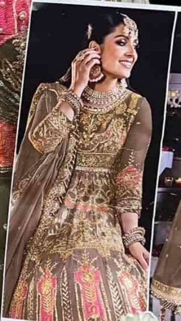
CHANTELLE Vol-7 TOP Butterfly net with Embroidery BOTTOM-INNER Dull Santoni DUPATTA Butterfly net with Embroidery