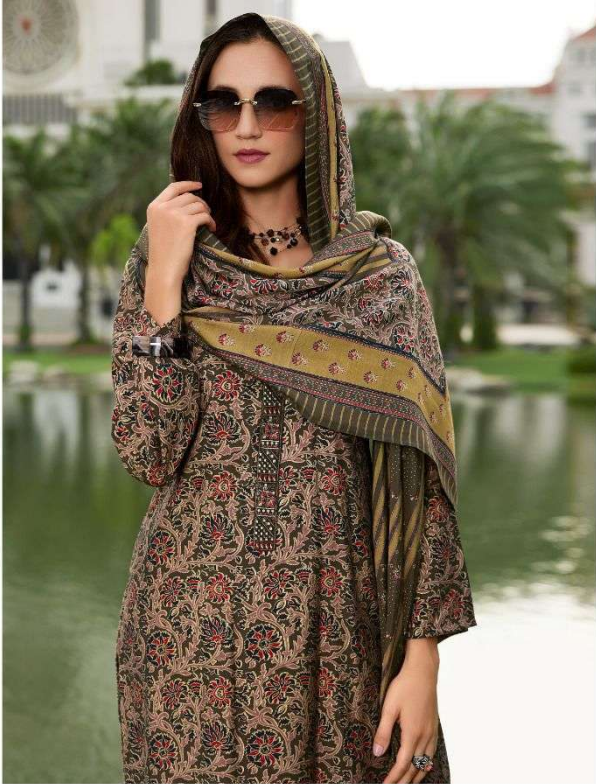
The colours of earth, orange and green, are as soothing as they are luminous. Add a understated radiance to your day with this dress. D.no.15672