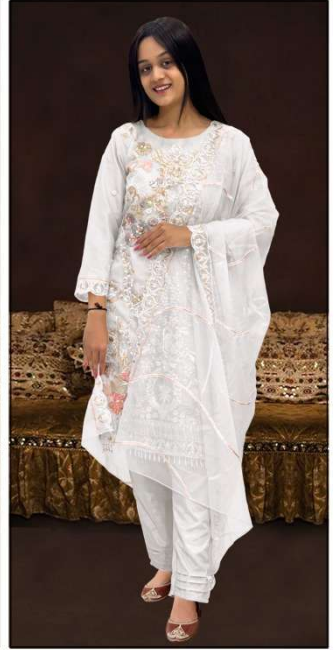
CODE: R-1071 D