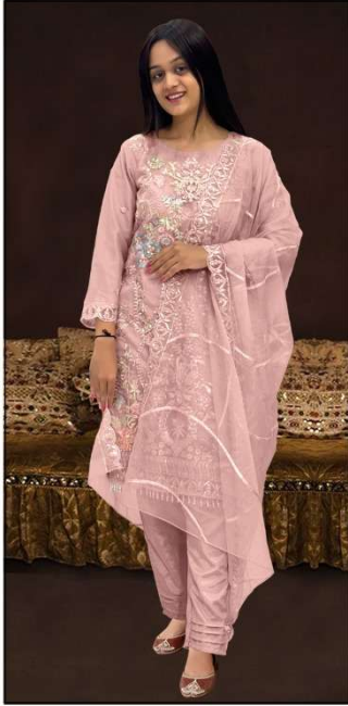
CODE: R-1071 A