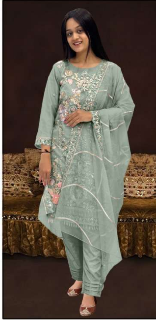
CODE: R-1071 C