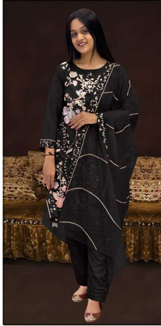
CODE: R-1071 B