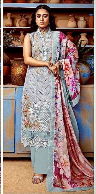
7773 D.No:-463 D