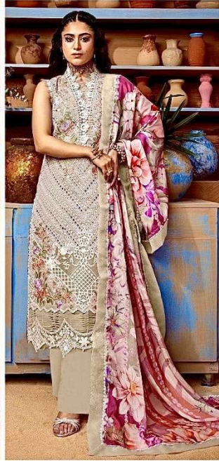
7773 D.No:-463 B