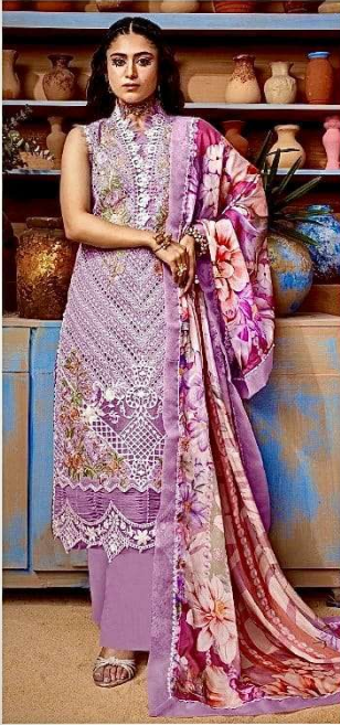
7773 D.No:-463 A

TOP- PURE HEAVY QUALITY JAAM COTTON WITH HEAVY EMBROIDERY AND SEQUENCE WORK BOTTOMINNER- HEAVY QUALITY RAYON COTTON DUPATTA- HEAVY QUALITY MUSLINE COTTON FANCY DUPATTA WITH DIGITAL PRINT