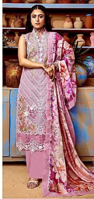
7773 D.No:-463 C