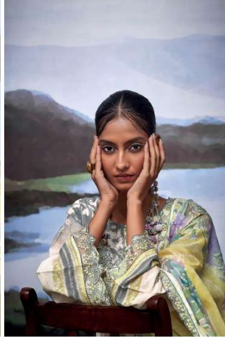
Let's take our hearts for a walk in the nature and listen to the magic whispers of mountains.