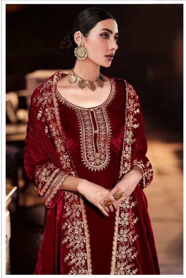
D.NO.160 - A

TOP :- VELVET DUPATTA :- VELVET BOTTOM :- VELVET WORK :- JARI SEQUENCE