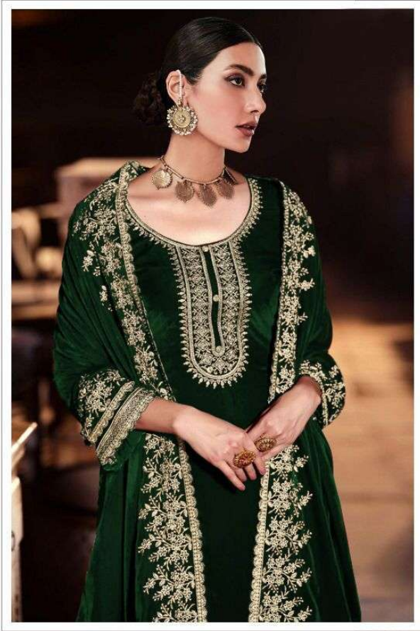
D.NO.160 - B

TOP :- VELVET DUPATTA :- VELVET BOTTOM :- VELVET WORK :- JARI SEQUENCE