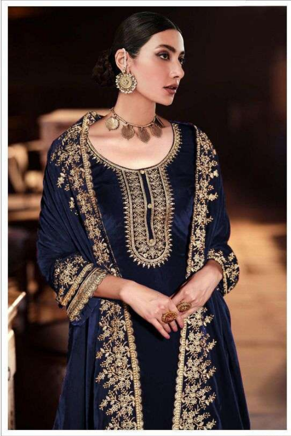
D.NO.160 - D

TOP :- VELVET DUPATTA :- VELVET BOTTOM :- VELVET WORK :- JARI SEQUENCE