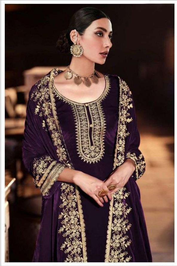
D.NO.160 - C

TOP :- VELVET DUPATTA :- VELVET BOTTOM :- VELVET WORK :- JARI SEQUENCE