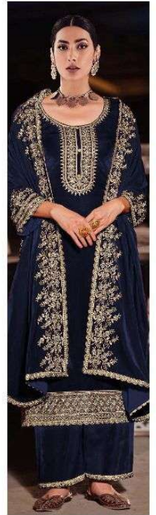
D.NO.160 - D