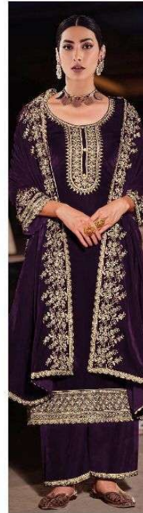
D.NO.160 - C