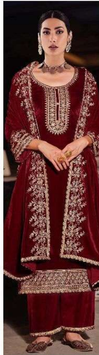
D.NO.160 - A