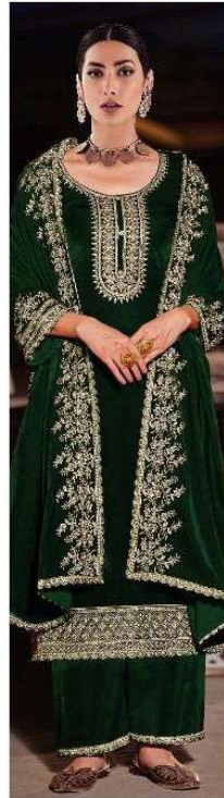
D.NO.160 - B