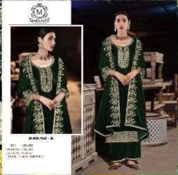
BRAND: MARYAM'S TOP: DRESS MATERIAL: COTTON COLOR: DARK GREEN SIZE: 36-40