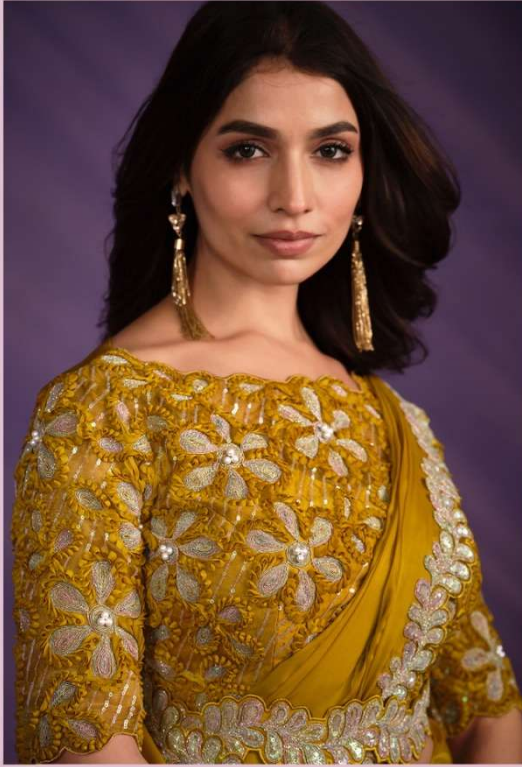
A luxurious affair of opulence, design, and desired splendor