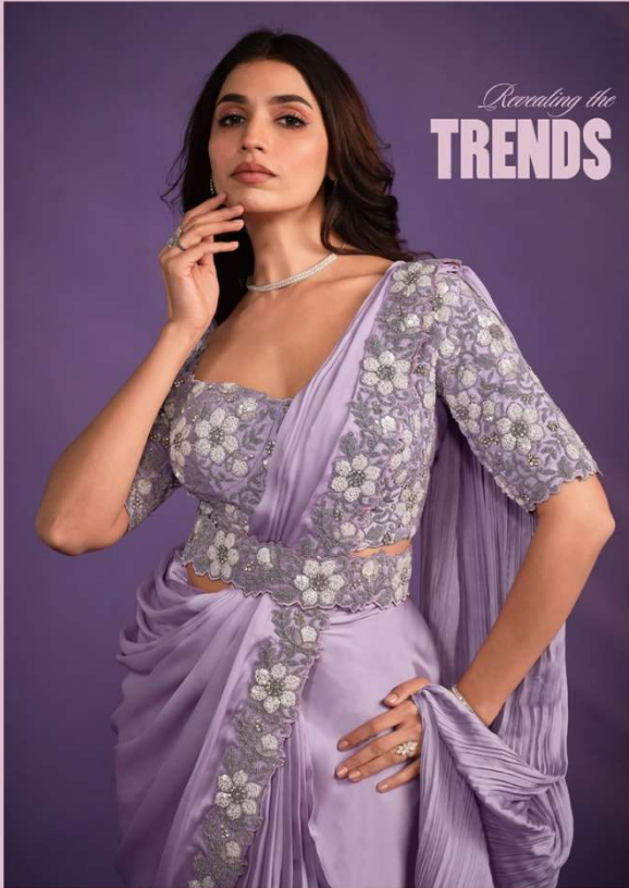
A Fashion Odyssey into the Pulse of Contemporary trends