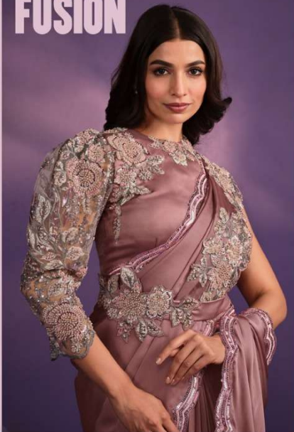
A Femme Fatale's journey through irresistible style dynamics