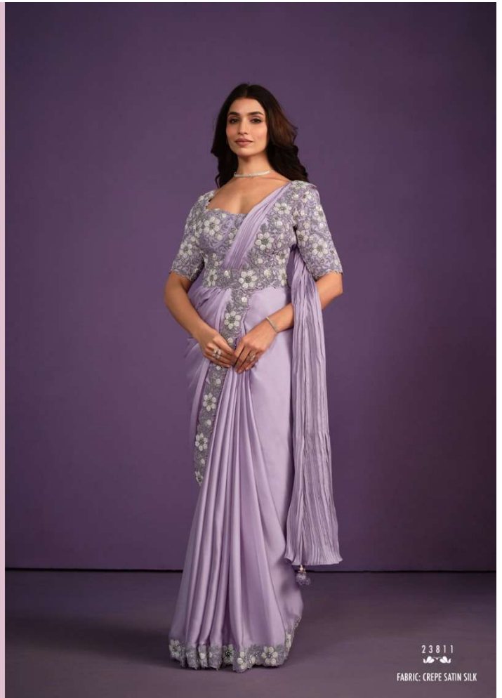
23811 FABRIC: CREPE SATIN SILK