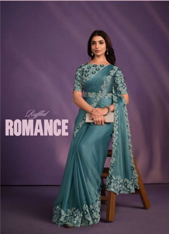
Get the magic of ruffles embarking on a journey through romance