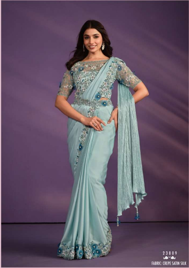
When tradition meets Innovation in every stitch of woven designs