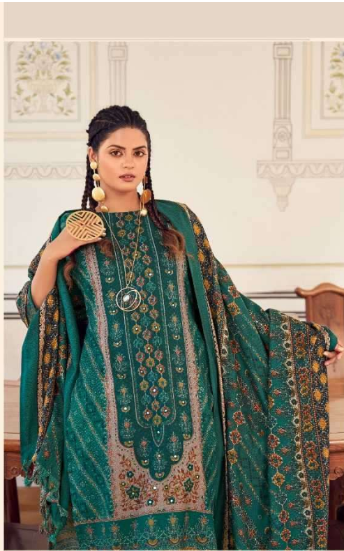
“ VINTAGE-INSPIRED LACE DRESS 855-003 ”