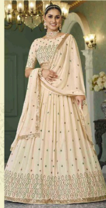
CODE : 176