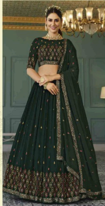
CODE : 175