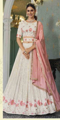
CODE : 174