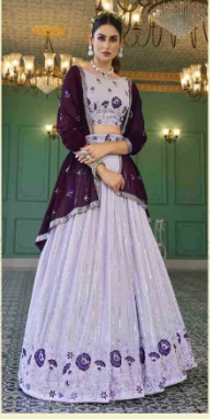
CODE : 171