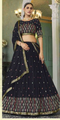
CODE : 173