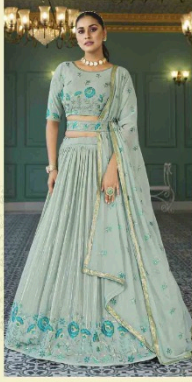
CODE : 172