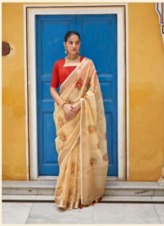
D. No. 2003