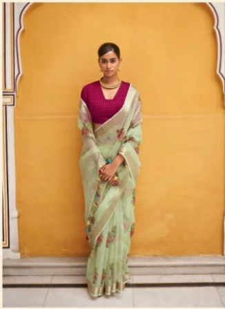
D. No. 2001