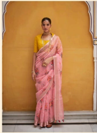
D. No. 2002