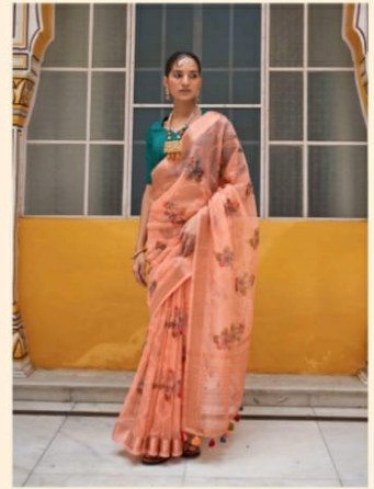
D. No. 2005