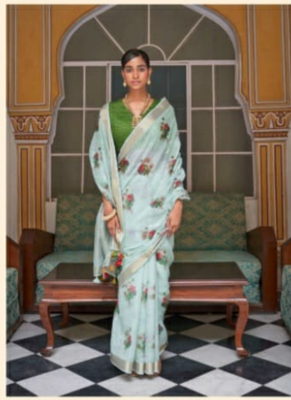
D. No. 2004